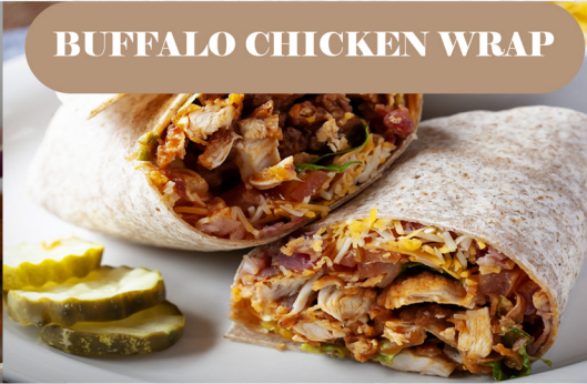
BUFFALO CHICKEN WRAP