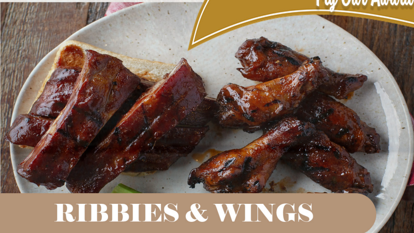
RIBBIES & WINGS