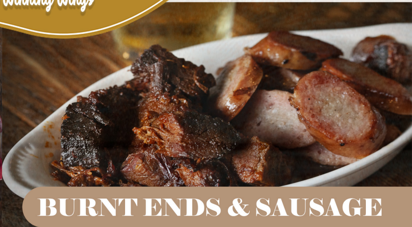
BURNT ENDS & SAUSAGE