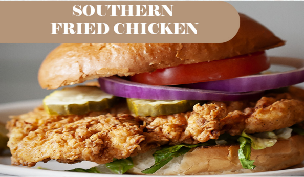
SOUTHERN FRIED CHICKEN